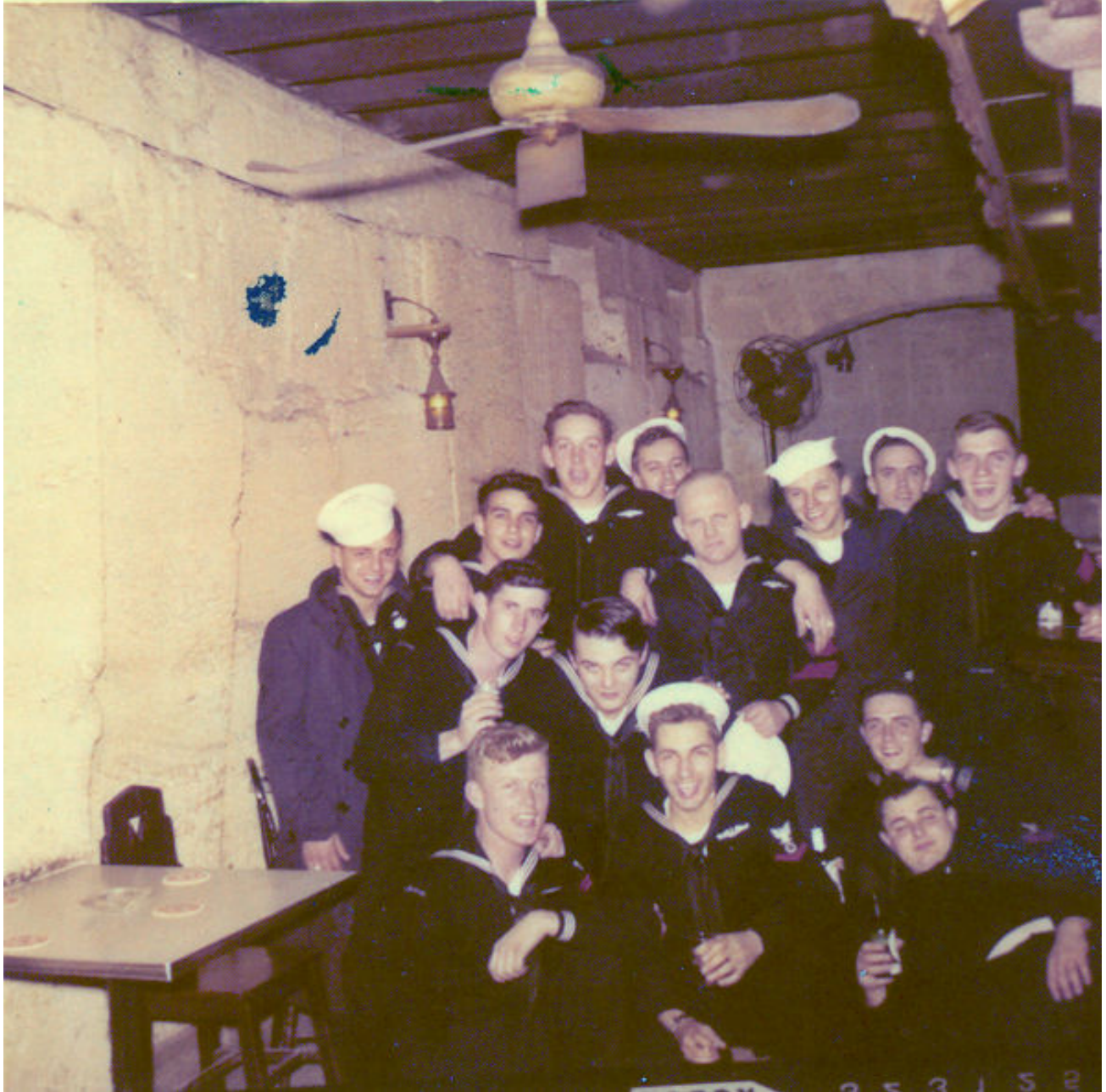
Roger USS Jallao November 1957- September 1960